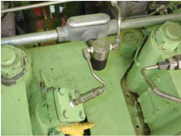
Pneumatic air distributor with pilot-actuated air-in-head valve

Installation of the SaveAir system on engines with an existing pneumatic air distributor (OEM or aftermarket) and pilot actuated in-head starting valve represents the least complex installation requirements to the user.