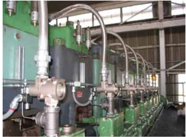
Cam actuated start valves with pressure-actuated in-head check valves

The SaveAir system includes a comprehensive ModBus-RTU-based Terminal Program for monitoring and configuration. As an alternative to the system Display Module, all system setup, including the angles between cylinders, air initiation and air duration maps, and engine-specific RPM settings for purge and engine run indication can be configured using this software. To assist in system installation and troubleshooting, the Terminal Program also enables the user to create a Microsoft Excel™ spreadsheet of all operating data associated with the SaveAir system from data logs taken and recorded three times per second. A unique screen capture option embedded into the system software also allows the user to acquire and save the monitored display and values for future reference or troubleshooting.